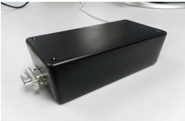
Receiver with serial port and power cord.